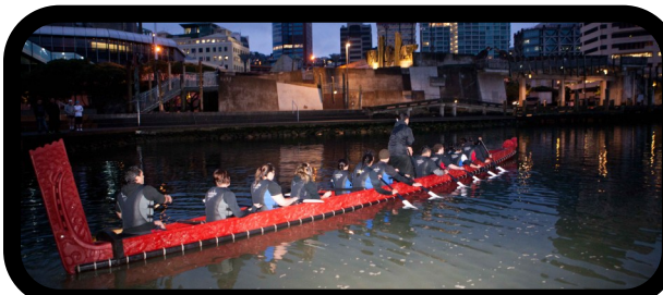
Below right: The launching of Te Hononga