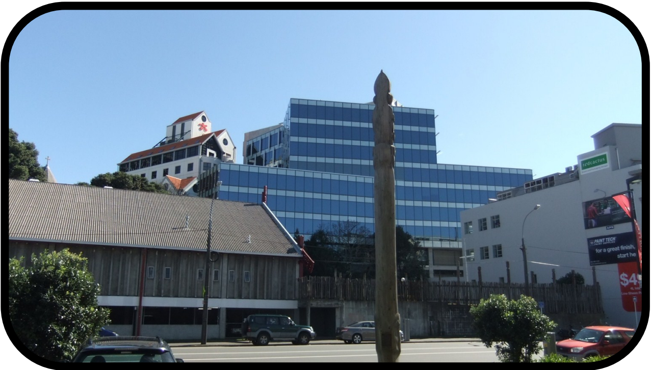
Pictured above: Pipitea House on Pipitea towering over Pipitea Marae. This photo has been taken from the "Gateway" shopping centre on Thorndon Quay

This flagship development for the Trust is a 5-star Green which has the long term tenancy of the Government Communications Security Bureau—a prime government tenant.