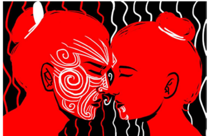
Two individuals performing a hongi, their wairua becoming one as they share the breath of life