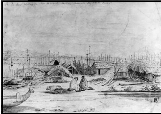
Pencil drawing of Te Aro Pa looking towards the Hutt River (circa 1842) attributed to Edmund Norman, Alexander Turnbull Library Ref: A-049-001

changed to allow the preservation in totality.