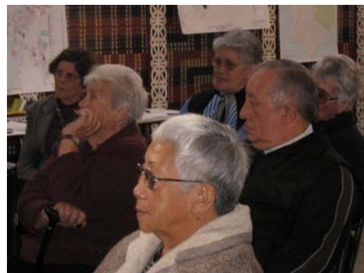
Photo shows kaumatua at hui on Friday June 2, 2006

Kaumatua contributed their views on important cultural sites and resources and what could be done to ensure the future prosperity for Taranaki Whānui ki te Whanganui a Tara. That information has been captured and together with information from the Cultural Redress Survey, will assist negotiations.