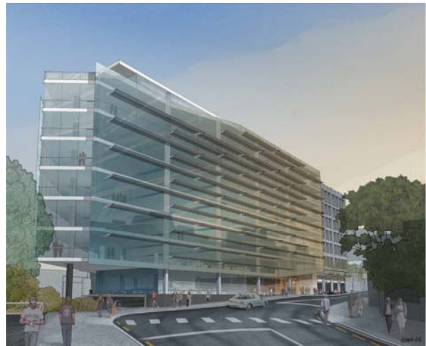
Pictured above: Artists impression of proposed development for Pipitea Street, Wellington

Beneficial owners also heard about a possible new development in Pipitea Street area. The owners gave their authority to the Managing Trustees to transfer the properties at 1-3, 5, 9, 11, 13 and 15 into a development company if the project is viable. Managing Trustees need to consider all information pertaining to the project before a decision will be made to proceed.